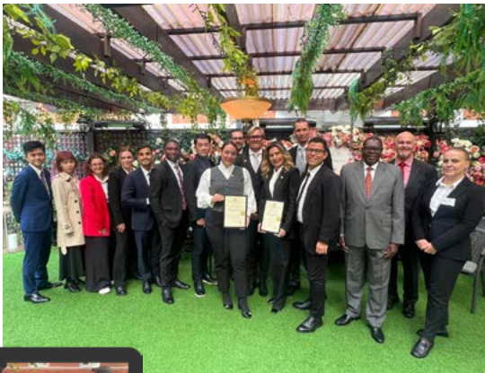
Butler School Class September 2024

We ask our students to judge us by our recent testimonials as this is, in our view a true benchmark of our training delivery standards which can be viewed on-line at: www.britishbutlerinstitute.com under recent testimonials.