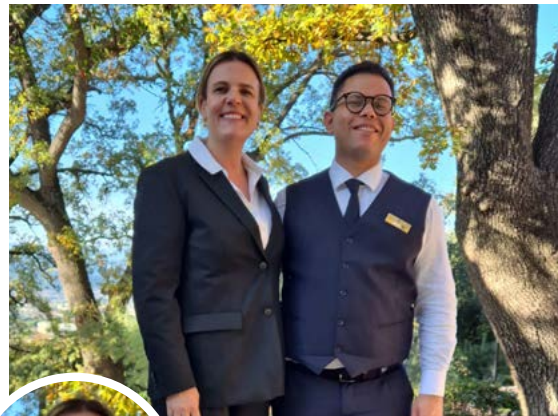
Students at Chateau de la Croix des Gardes in Cannes